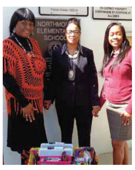
literature. FCCD Chapter 10 hopes you have bright futures and we hope to visit you again. Go Panthers!!