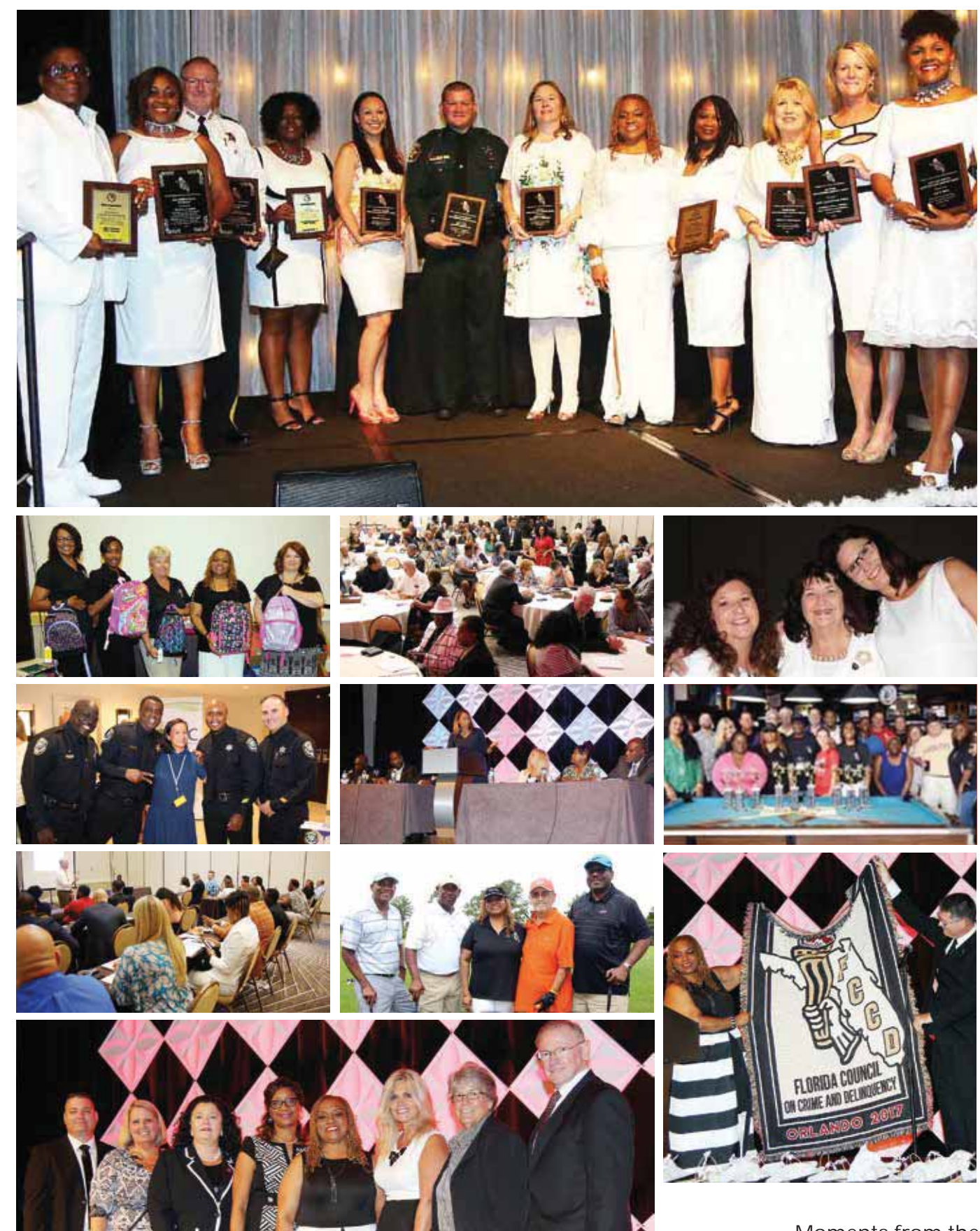
Moments from the 88th Criminal Justice Institute